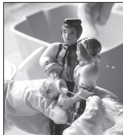
A flood damaged artifact receives a thorough cleaning

to Chicago for further treatment. We are optimistic that most of these damaged artifacts can be restored.