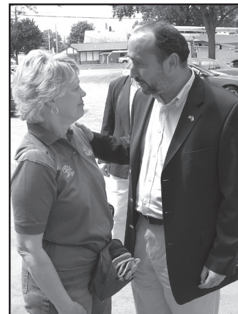
Marek Skolil, Consul General of the Czech Republic, tours flood damage on June 24

Literally four days after the flood, we were scheduled to reveal the latest proposed building design (which followed extensive program analysis, building needs assessment and public meetings) for an expansion of the museum and library. Because of our success, we have outgrown our current space and those needs have not changed. But