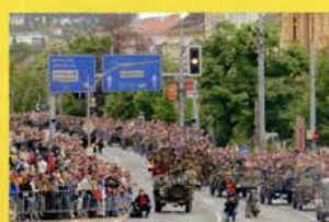
Crowds gather during the Plzeň Liberation Festival