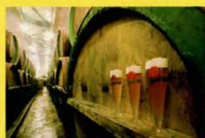
Barrels and glasses of pivo inside the Pilsner Urquell brewery.