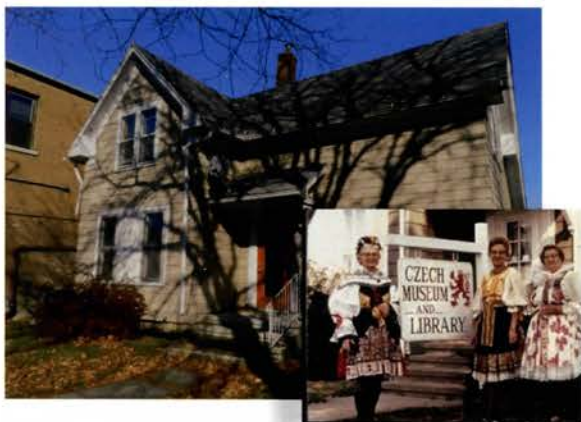
The original museum house still stands in Cedar Rapids' Czech Village, one block from the NCSML